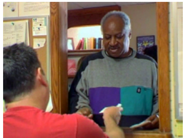
Clients Receiving Vouchers