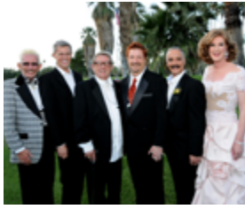
Les Originales, 2010