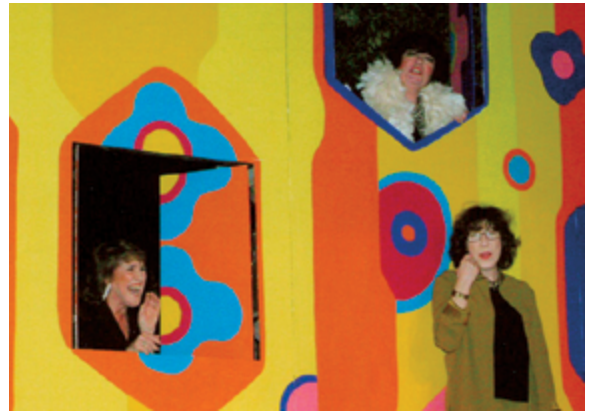
The Cast of Laugh-In, 2006

During the performance she mesmerized the crowd with her incredible vocal range and renditions of some of her most popular hits including ‘You’re the Best Thing That Ever Happened to Me,’ ‘Neither One of Us (Wants to Be the First to Say Goodbye),’ ‘I Heard it Through the Grapevine,’ and ‘If I Were Your Woman.’ The audience was captivated by her soulful rendition of her classic ‘Midnight Train to Georgia.’