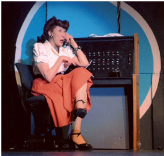
Lily Tomlin, 2006