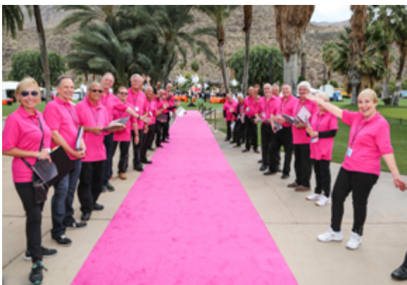
Evening Under the Stars volunteers line up on the pink arrival carpet