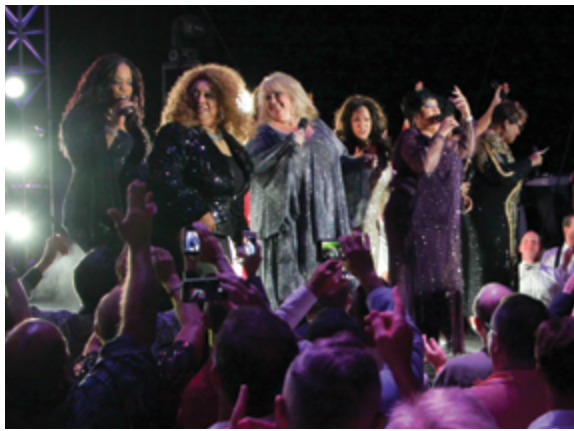
The First Ladies of Disco, 2014

As the reunited members of Chic sang, it was back to the 'Good Times.' Two of the vocalists had performed together since Chic broke up in the early 1980s, but this was the first time all three had performed together as a group. They stunned the audience as they sang 'Le Freak'.