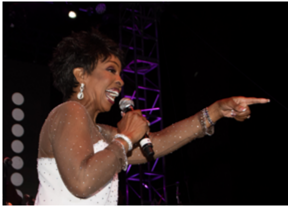
Gladys Knight, 2018