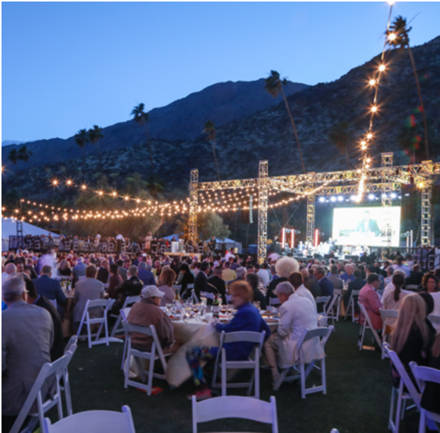
Evening Under the Stars, 2017