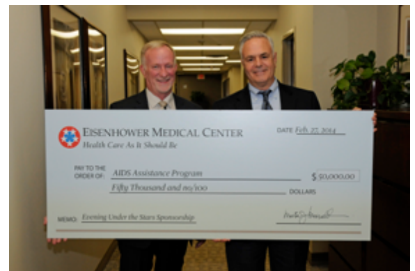
Eisenhower check presentation, 2014

Walgreens Holiday Stockings gift to clients