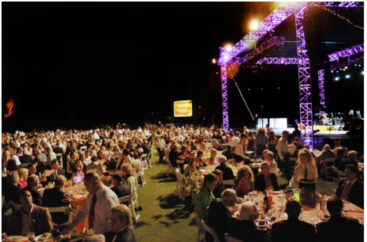
Evening Under the Stars stage